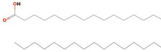
Fatty acid (Hexadecanoic acid)

The biological function of the hydrocarbons produced by FAP in microalgae is still not clear but a function linked to photosynthetic membranes is likely. Indeed, in the model microalgae Chlamydomonas reinhardtii , it has been shown that